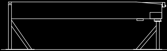
High level chassis